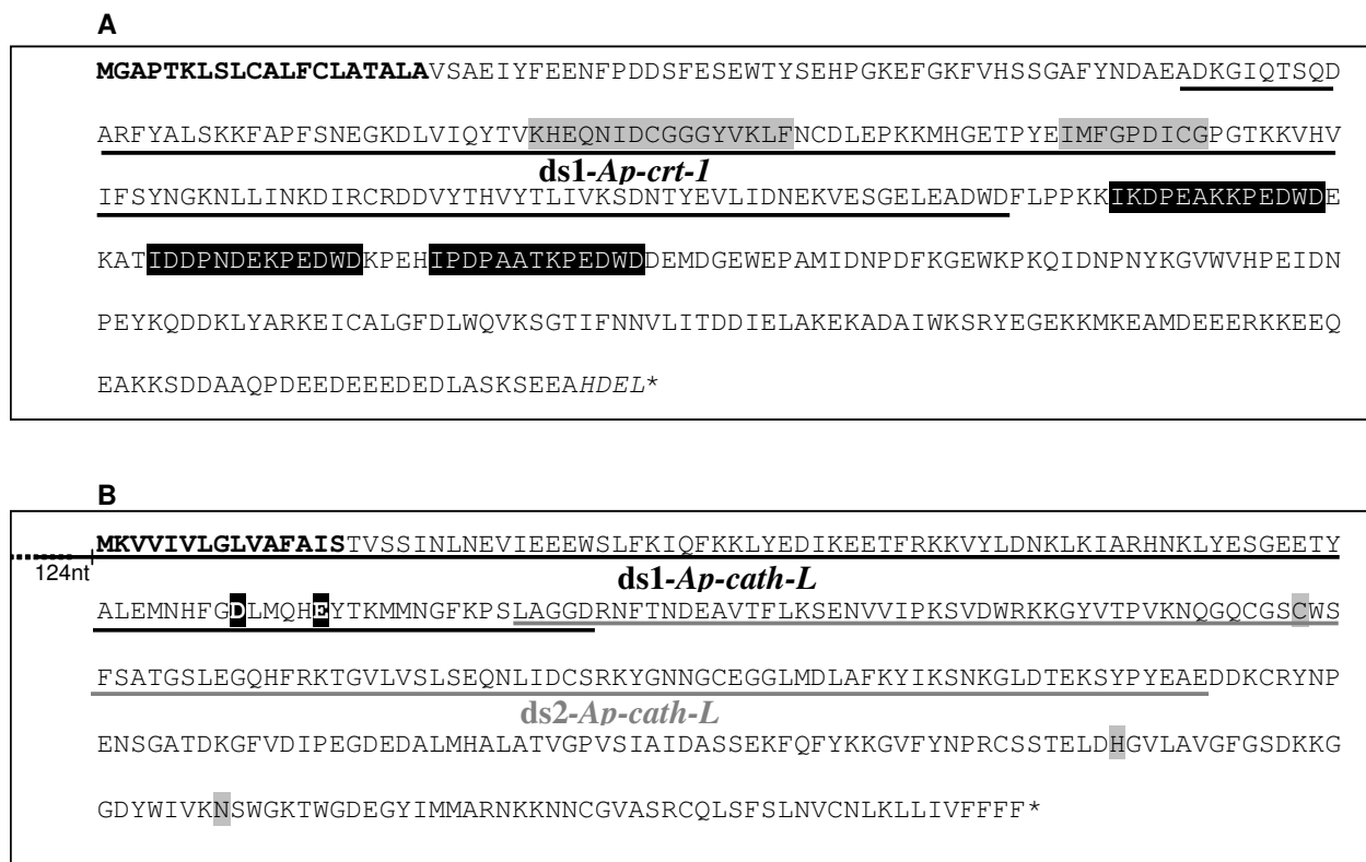
Figure 1 Deduced amino-acid sequences of calreticulin (Ap-CRT-I) and cathepsin-L (Ap-cath-L) from Acyrthosiphon pisum. A. Deduced protein sequence of AP-CRT-I. Secretion signal peptide of 20 AA predicted by PSORTII [20] is bold, endoplasmic reticulum retention peptide "HDEL" is italicised, signature motifs of the calreticulin family are in black boxes, conserved repeated calreticulin sequences are in grey boxes. The location of the gene sequence used to synthesize dsRNA ds1-Ap-crt-1 is underlined. B. Deduced sequence of AP-CATH-L. Secretion signal peptide of 15AA is bold, conserved residues of active site are in black boxes and conserved carboxylic side chains important for acid autocatalytic processing of L cathepsins are in grey boxes. The location of the gene sequence used to synthesize dsRNA ds1-Ap-cath-L and ds2-Ap-cath-L are underlined in black and grey, respectively.